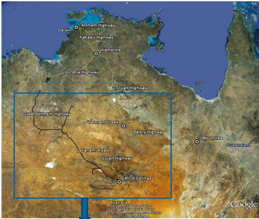
Figure 1 – Map showing Tanami Road within the NT and main Aboriginal community links